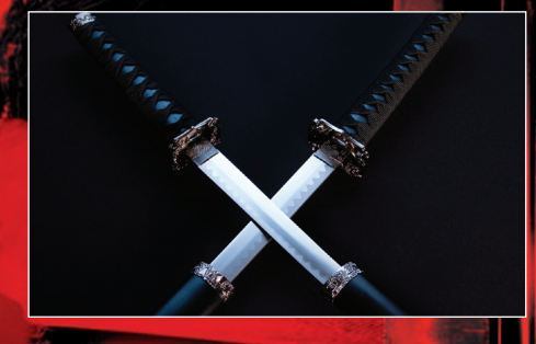
The invincible double sword samurai technique